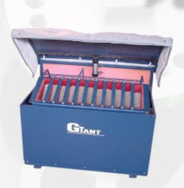
Giant GT series are available with dividers for impingement free processing.