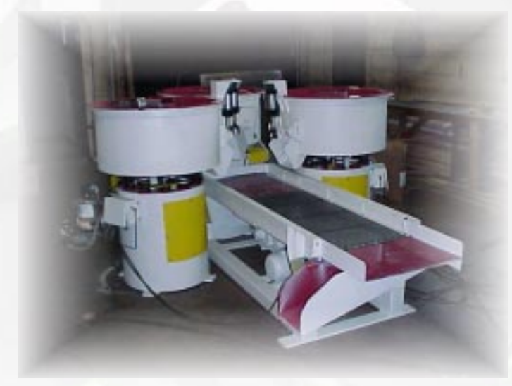
Multiple process bowls feeding a common screen deck. Unique solution engineered systems like this are what separate Giant from the rest.

small footprint of only 80 inches by 70 inches, up to 1,000 gallons can be processed in 30 minutes, requiring only 10 minutes of low-skilled attendance.