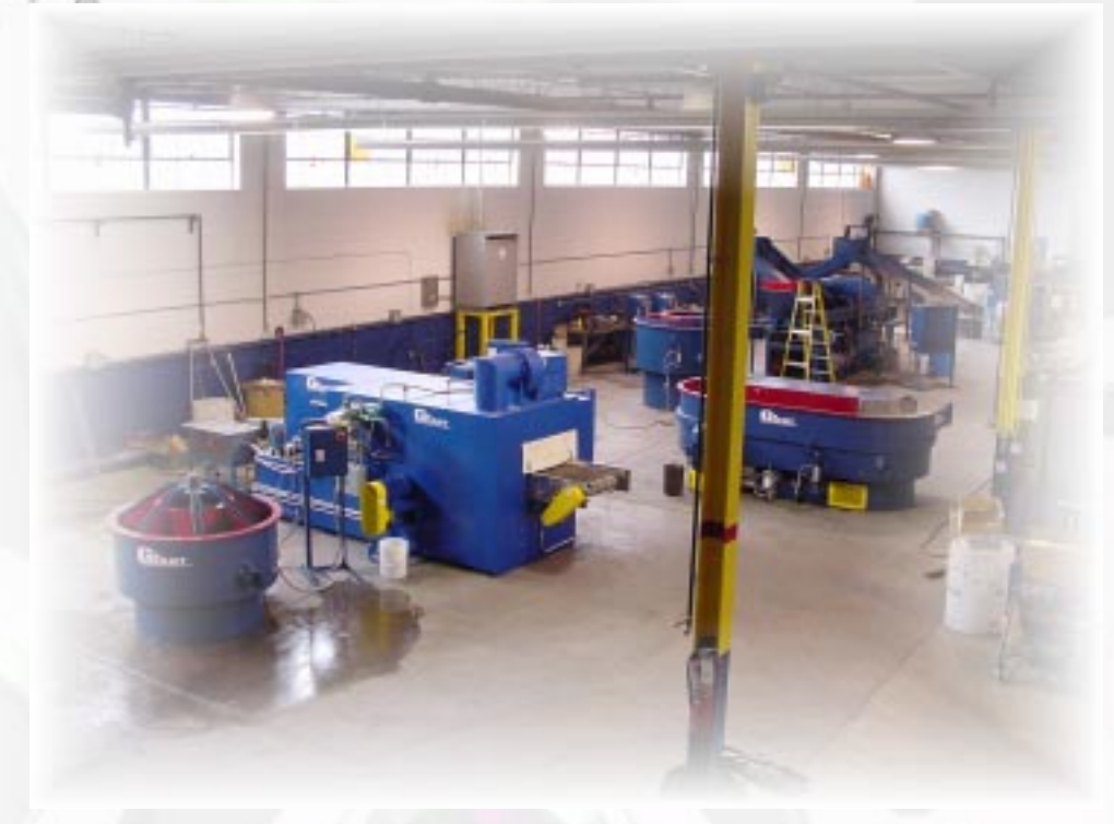
Giant's final assembly and customer approval area where systems are "field" tested by the customer before shipping.

Giant Finishing is all about the final product. No matter what you make, if you bend it, stamp it, turn it, shear it, mold it or cast it, Giant can create custom finishing solutions that optimize your finishing thru-put.